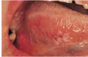
Cancer on the tongue