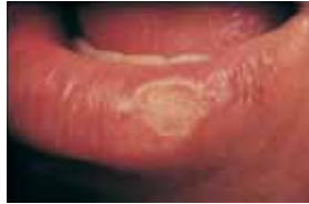
Cancer on the lip