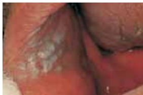
Leukoplakia (which can turn into cancer) inside the cheek

Be aware of any changes in your mouth and throat.